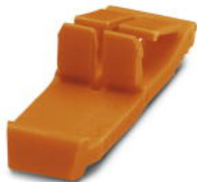
Latching, length: 28.9 mm, width: 6.8 mm, number of positions: 2, color: orange

Please be informed that the data shown in this PDF Document is generated from our Online Catalog. Please find the complete data in the user's documentation. Our General Terms of Use for Downloads are valid ( http://phoenixcontact.com/download )